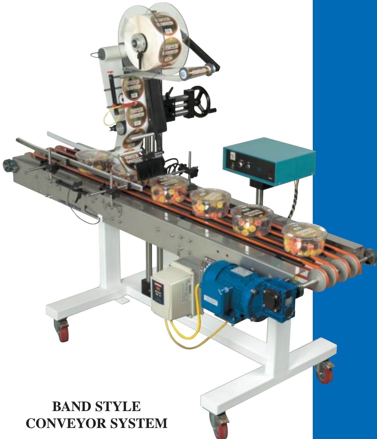
BAND STYLE CONVEYOR SYSTEM